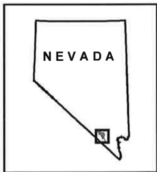
EXHIBIT A Forest Order 04-17-18-06 Fire Restriction

Humboldt-Toiyabe National Forest Spring Mountains National Recreation Area